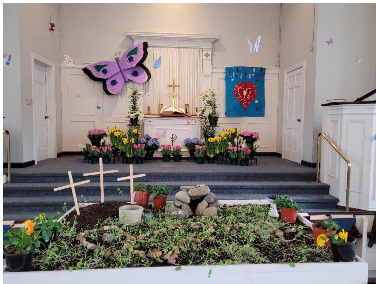
Photo: Our finished Lenten Prayer Garden on Easter Sunday with the stone rolled away.