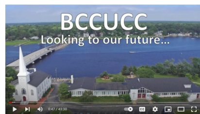
June 11, 2023 annual meeting

A video of the BCCUCC Annual Meeting held after worship on Sunday, June 11 is available for viewing at https://youtu.be/ZiJsbqzCbGU . It includes the slide presentation and explanation by members of the Governance Ministry Task Force (GTMF) of their proposed new church structure, and the discussion with the congregation that followed.