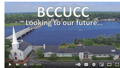
June 11, 2023 annual meeting

At the BCCUCC Annual Meeting held 6/11/23, members of the Governance Ministry Task Force (GMTF) gave a slide presentation and explanation of their proposed new church structure, and a discussion with the congregation followed. A video of the meeting can be viewed at https://youtu.be/ZiJsbgzCbGU .