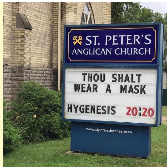
Seen outside a church in England!

The BCCUCC Guidelines for Outdoor Gatherings is a one page document that all are asked to read and observe. Thanks to Peggy Matteson for all the research and work she did creating the document.